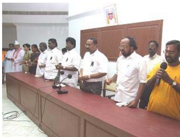
Paying homage at the beach; paying homage at the Collectorate; Prayer meeting; Book release