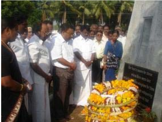
Paying homage on the 2nd Anniversary of the Tsunami