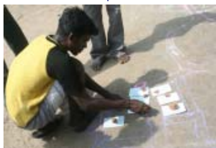
PRA in progress

Based on the discussions the participants of the workshop mapped the affected and vulnerable at different stages of relief & rescue, rehabilitation, and development. A Participatory Rural Appraisal (PRA) exercise was carried out in two hamlets Keezhatincheri and Nambiar Nagar.