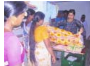
Alaimakal products for sale

cream vending, retailing ready-made clothes purchased from wholesalers, hollow brick making and tailoring. The products are popular under the brand name "Alaimakal" (the daughter of the waves). The monthly saving of each member has grown to Rs.100-125 per week, which is more than their pre-tsunami enterprise fetched.