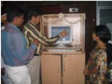
A touching moment - Dr. J Radhakrishnan IAS inaugurating the touch screen at the Collectorate

The District Collector, Dr. J Radhakrishnan IAS 'touched' open a touch screen information system for the public at the District Collectorate, Nagapattinam on 21 December 2005. The touch screen, located at the foyer of the Collectorate provides vital information on Tsunami damages and rehabilitation efforts, various publications and studies, and statistics related to Tsunami relief and rehabilitation. This information is available in Tamil and English. The initial interest shown by the public is encouraging. Photographs relating to relief and rehabilitation seem to be the most popular information accessed till date. ■